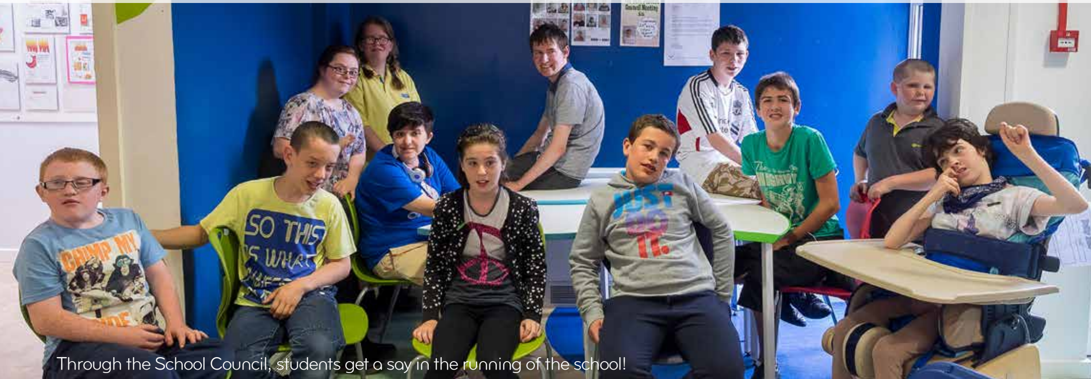
Through the School Council, students get a say in the running of the school!